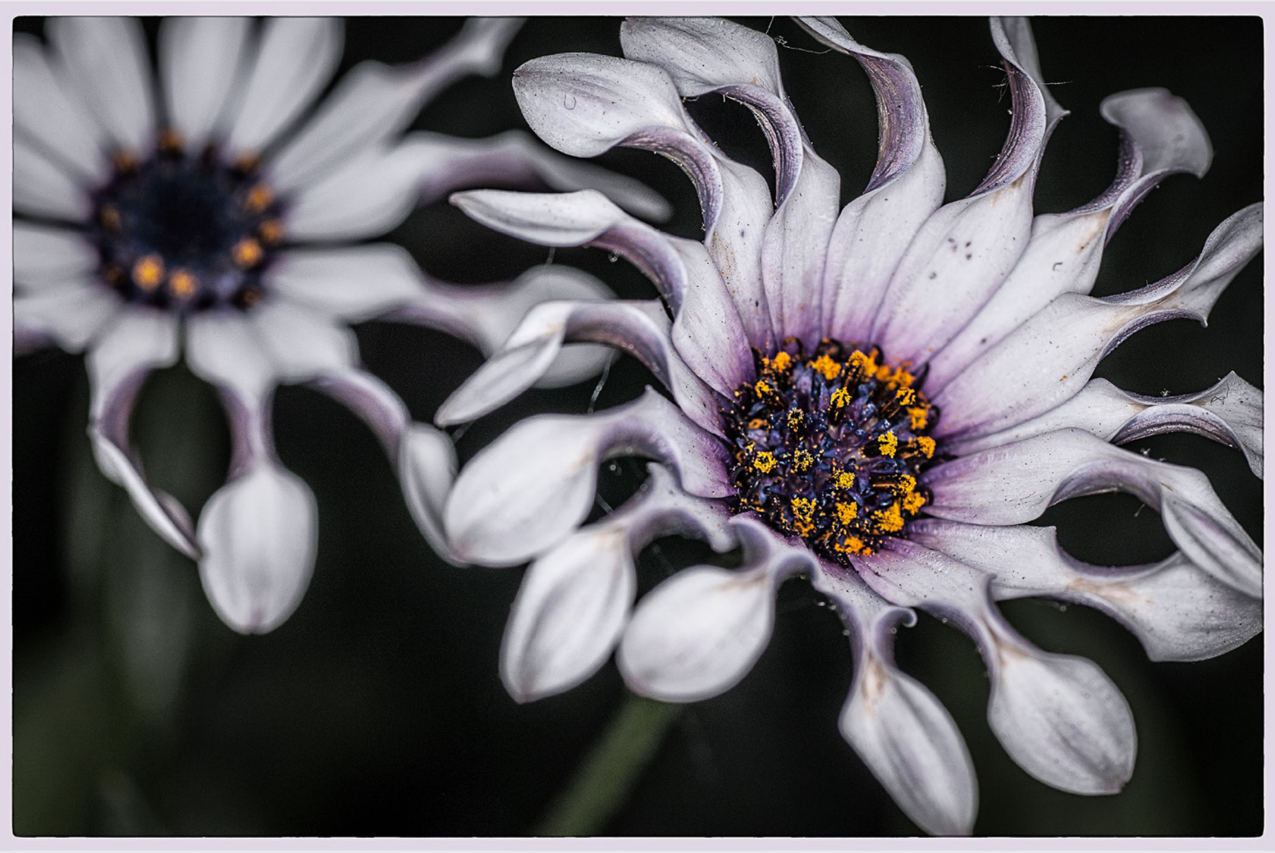
Frolic, 2014.