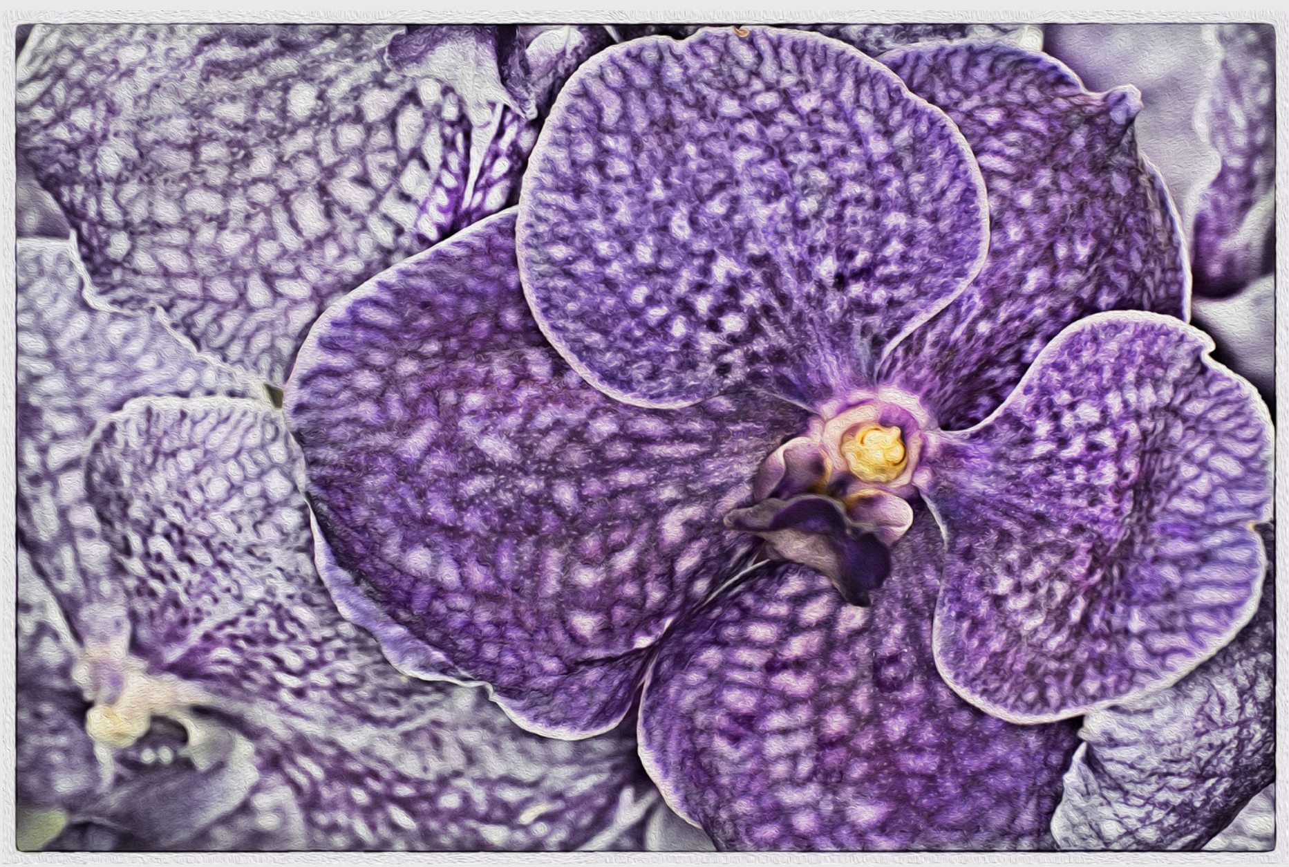
Rainbow Orchids, 2013.