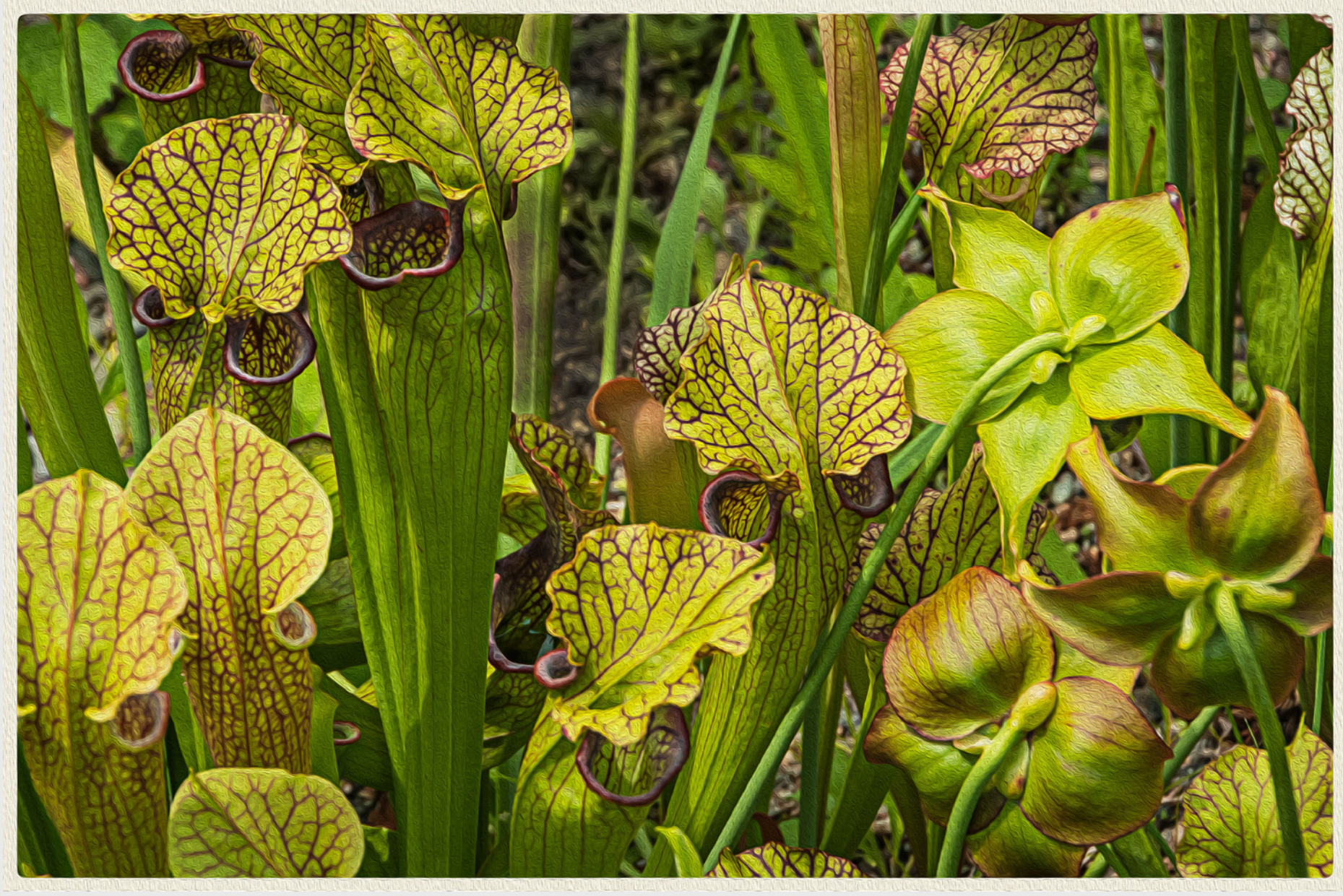
Carnivores2, 2015.