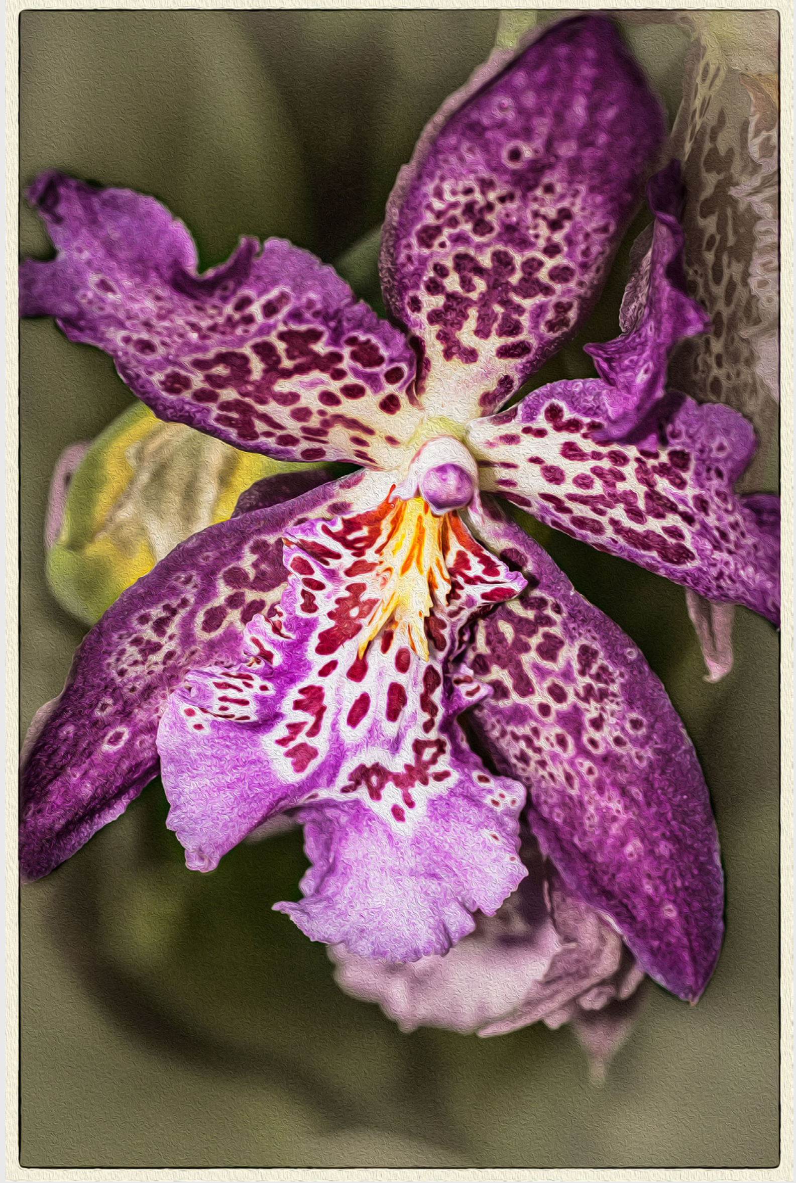
Dancing Orchid, 2014.