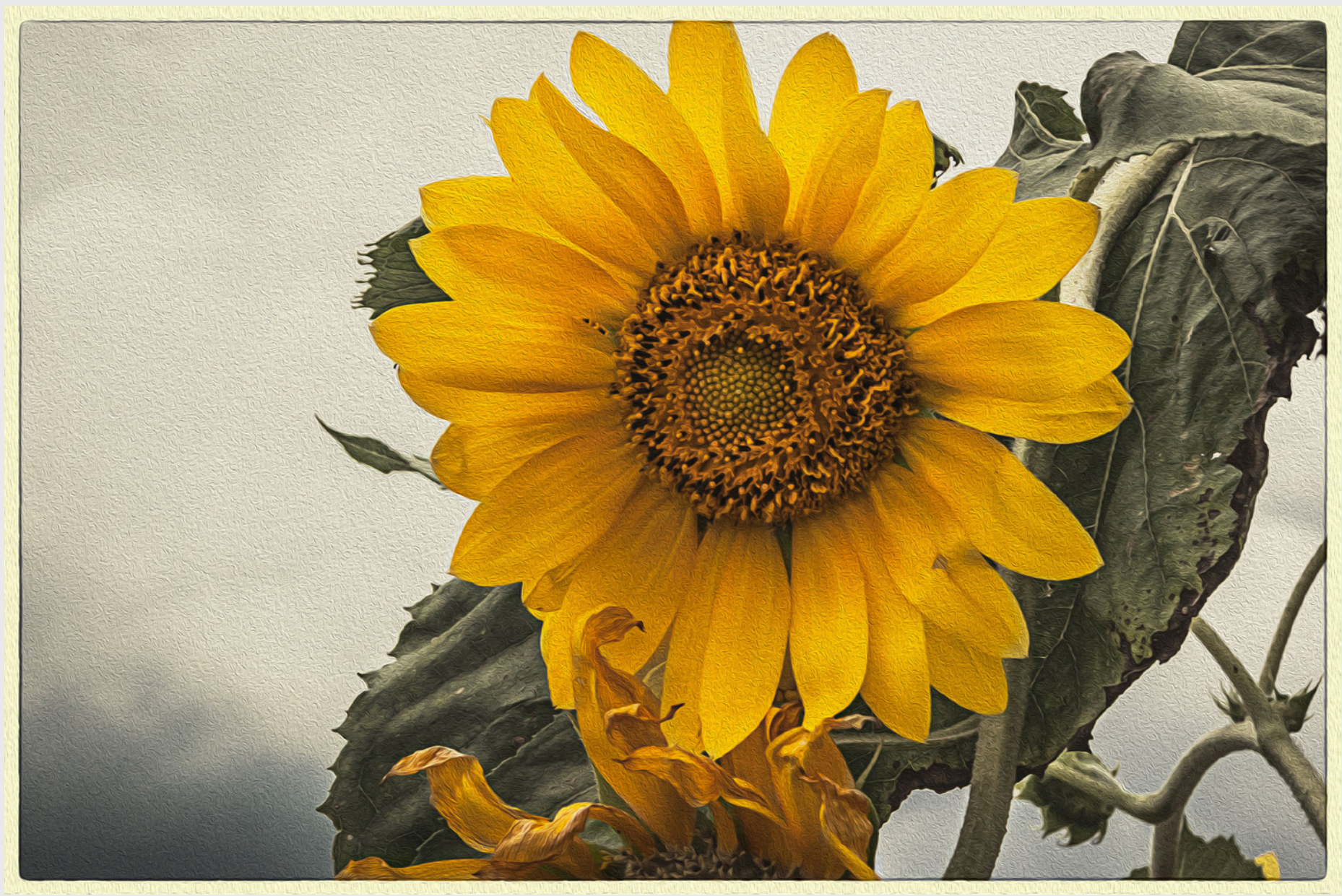
September Sunflower3, 2015.