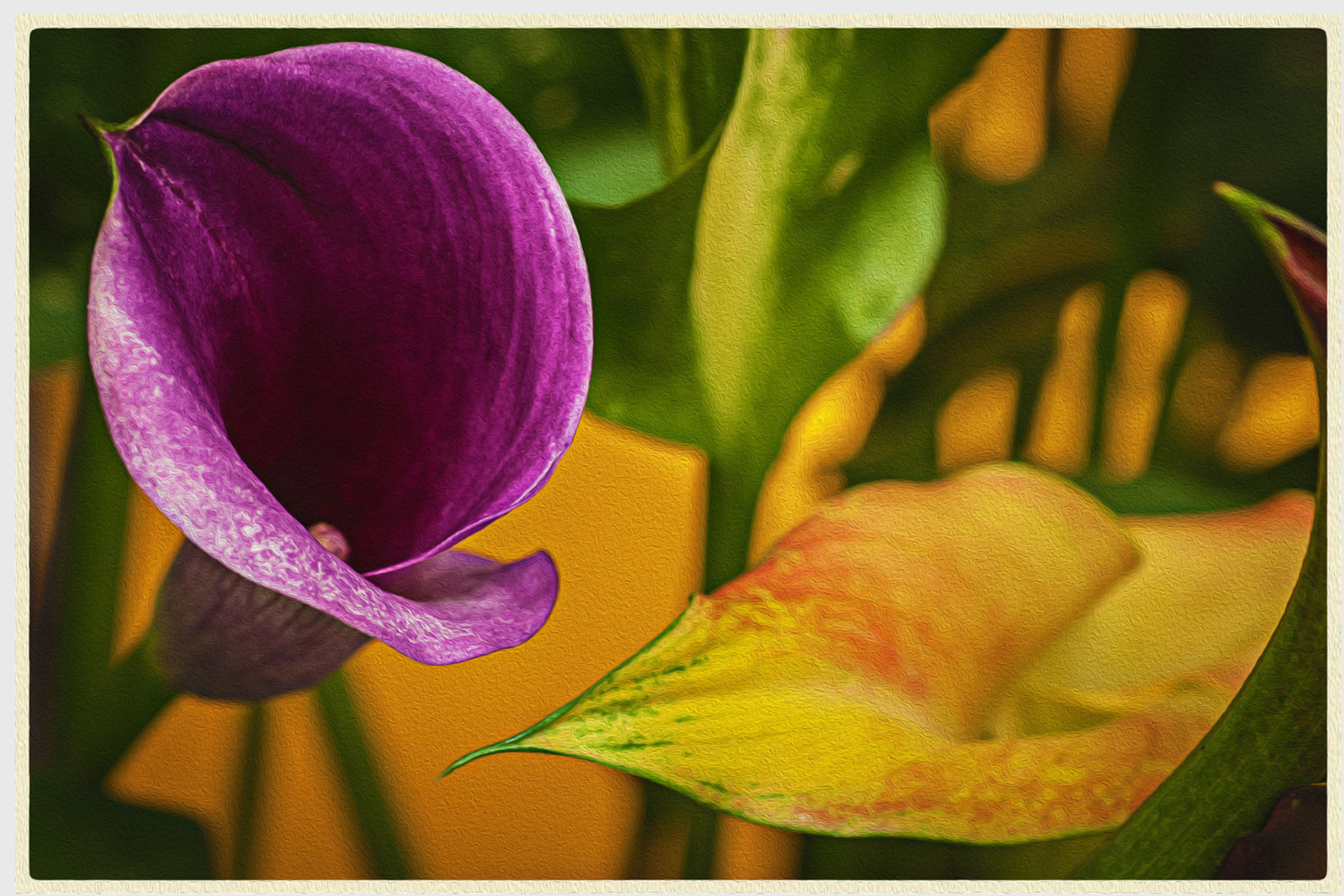
Purple Calla Lily, 2015. ©Barbara Leven