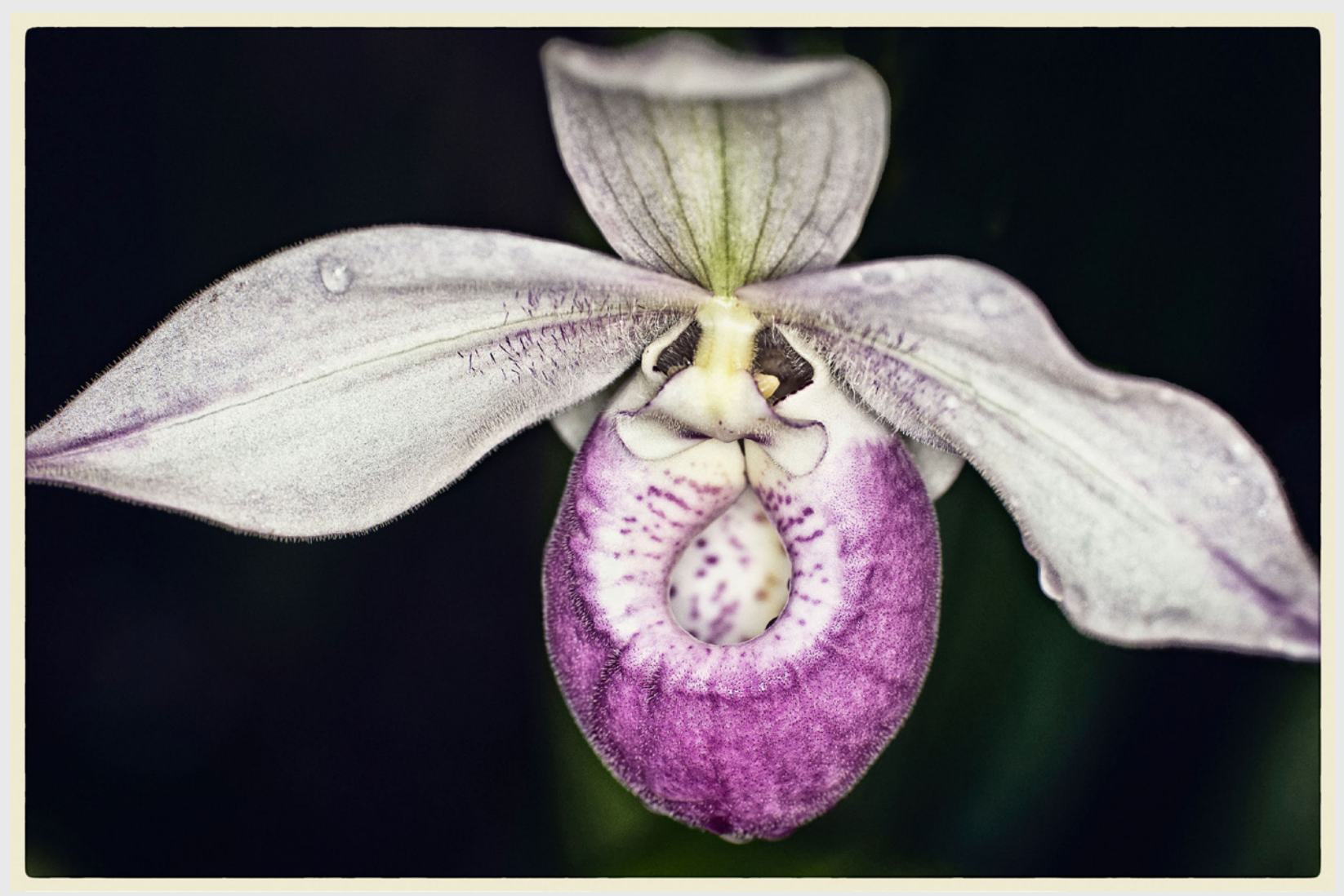
Brooklyn Orchid, 2012.

March 30, 2005: It is cold, windy and grey. Weary and drained by a long winter and in need of solace, I pick up my camera and ride the subway to the Brooklyn Botanic Garden. Although I have lived almost my entire life in New York City, I have never visited this Garden before. The trees are still bare but when I look closely I see the promise of Spring in the beginning buds. The wind ripples across the sleeping lily pools, the pale sun glinting on small tangerine-colored koi darting here and there beneath the shadows.